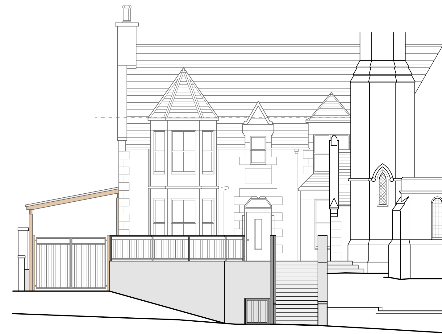
East Elevation 1:100