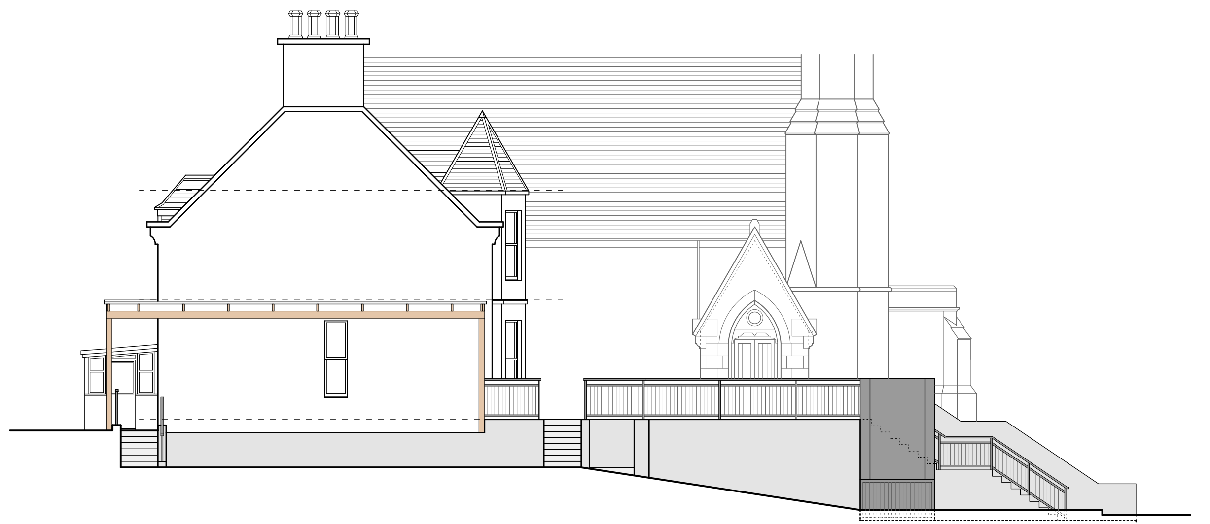
South Sectional Elevation 1:100