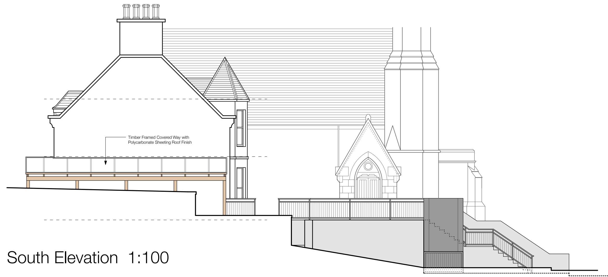
South Elevation 1:100